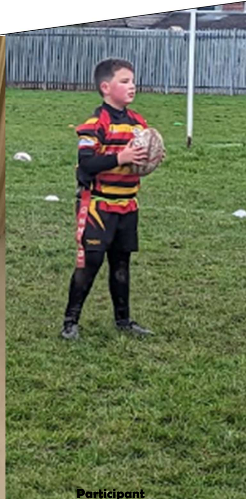
Participant programme information